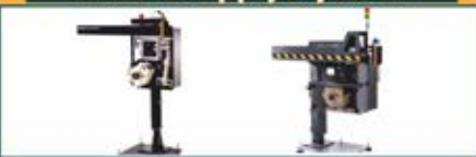
Pallet Print & Apply Systems