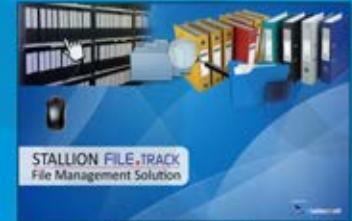
File Tracking System