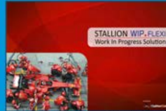
Work in Progress Applications