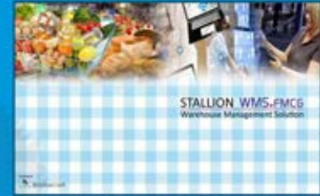
Food Products Warehouse Management