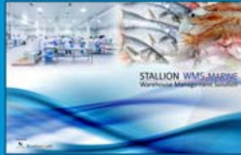
Marine Products Warehouse Management