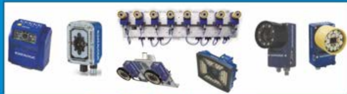
Image Based Fixed Mount Scanners

DS1100 DS2200 DS4800 DS5100 DS8110 DX8200A DS1500 DS2100N 2K SERIES DS2400 N 2K SERIES DS6300 DS8210