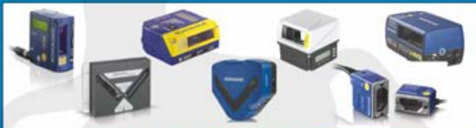
Laser Fixed Mount Scanners

DS1100 DS2200 DS4800 DS5100 DS8110 DX8200A DS1500 DS2100N 2K SERIES DS2400 N 2K SERIES DS6300 DS8210