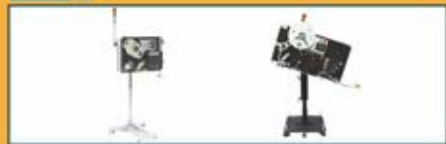
Case and Pack Print & Apply Systems